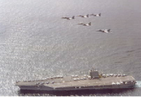
Figure 4: A group of F-14 "tomcat" fighters fly directly over a U.S. Navy aircraft carrier.